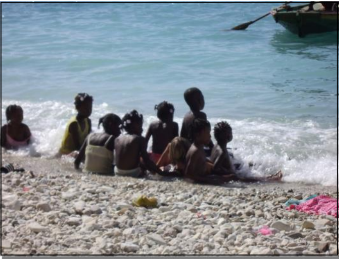
Some of the children resting in between fun