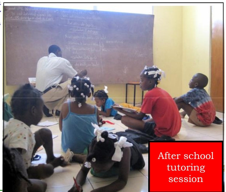
After school tutoring session