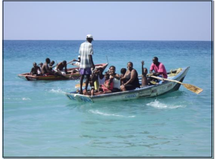
Heading out for sightseeing